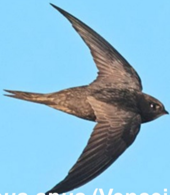
Apus apus (Vencejo común)