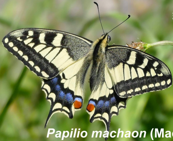
Papilio machaon (Macaón)