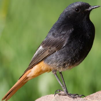
Phoenicurus ochruros (Colirrojo tizón)