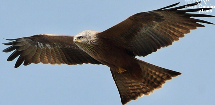
Milvus migrans (Milano negro)