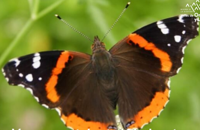
Vanessa atalanta (Almirante rojo)