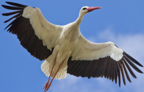
Ciconia ciconia (Cigüeña blanca)