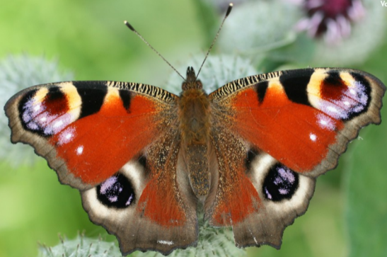
Aglais io (Pavo real)