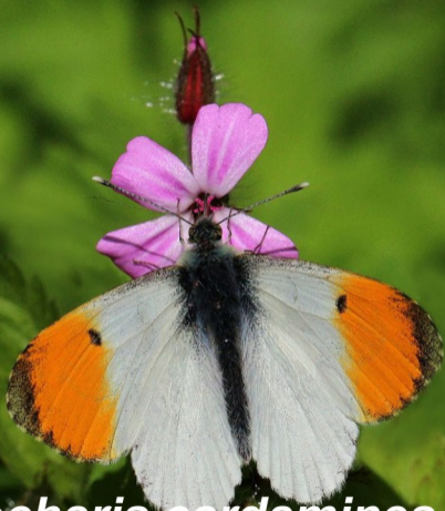
Anthocharis cardamines (Aurora)