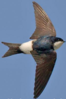
Delichon urbicum (Avión común)