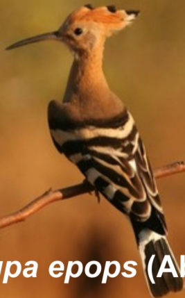
Upupa epops (Abubilla)