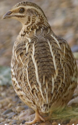
Coturnix coturnix (Codorniz)